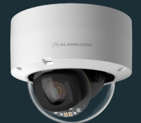
Pro Series 1080p Dome PoE Camera with Varifocal Lens (ADC-VC847PF)

Learn more about Commercial Video Surveillance and access marketing, installation, and support resources on the Partner Portal.