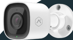
Pro Series 1080p PoE Mini-Bullet Camera (ADC-VC727P)