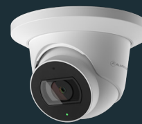
Pro Series 4MP Turret PoE Camera with Varifocal Lens (ADC-VC838PF)