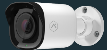
Pro Series 4MP Bullet PoE Camera with Varifocal Lens (ADC-VC728PF)