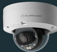
Pro Series 1080p Dome PoE Camera with Fixed Lens (ADC-VC827P)