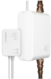
Smart Water Valve+Meter ADC-SWM-150