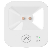
Alarm.com Water Sensor* ADC-S40-W