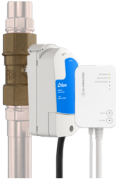
Smart Water Valve ADC-SWV100